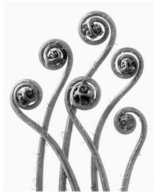
FIGURE 1.1 left Karl Blossfeldt, Equisetum hyemale , 1898–1928. Gelatin silver print, 23%6 × 95%6 inches (59.5 × 23.7 cm). Thomas Walther Collection, gift of Thomas Walther, the Museum of Modern Art. Digital image copyright the Museum of Modern Art/licensed by SCALA/Art Resource, New York.

FIGURE 1.2 above Karl Blossfeldt, Adiantum pedatum , American maidenhair fern, before 1928. Young rolled-up fronds enlarged eight times. Gelatin silver print, 115/8 × 95/16 inches (29.5 × 23.6 cm). Thomas Walther Collection, purchase, the Museum of Modern Art. Digital image copyright the Museum of Modern Art/licensed by SCALA/Art Resource, New York.